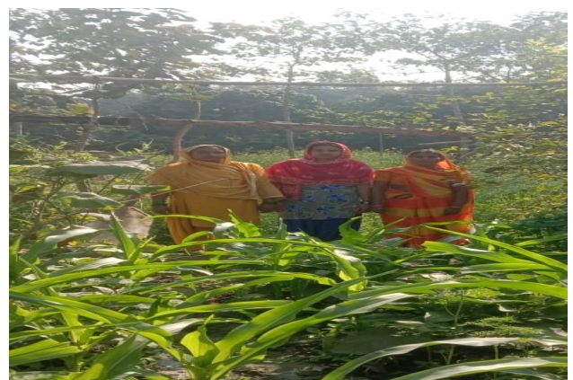
Share cropping under BSLD Project Bandra supported by heifer international funding