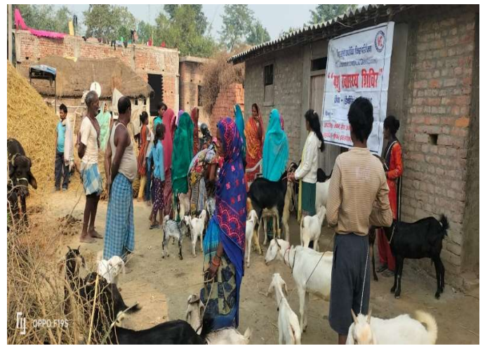
Photo of animal medical camp during Goat deworming