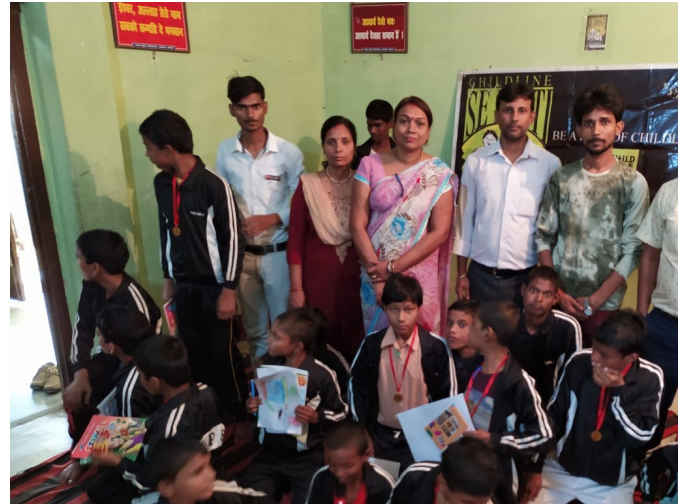
Open house activity done by CHD team on Chhapra Jn.