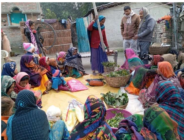
During make to the organic pesticide under BSLD project Banda Muzaffarpur