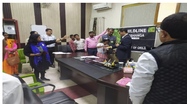
CHILDLINE SE DOSTI activity done by Collaborative team Darbhanga supported by CIF with administrative officer Darbhanga