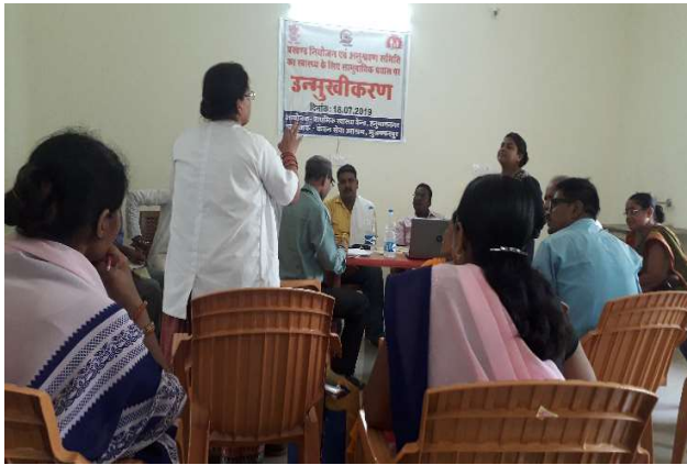
Photograph of the activity