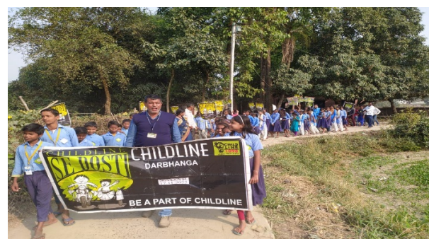
Awareness program done through meeting and rally with children by CHILDLINE collab Darbhanga team