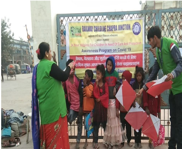
Awareness program done by CHD team on Chhapra Jn.